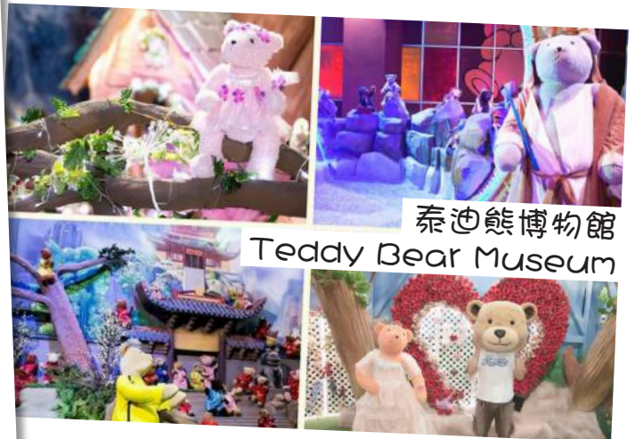
泰迪熊博物館 Teddy Bear Museum